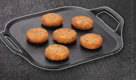
CAST IRON SQUARE TAVA