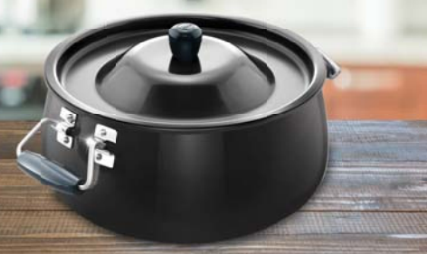
BIGBOY BIRYANI HANDI