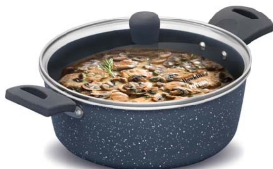
COOK n SERVE BOWL

MRP = MAXIMUM RETAIL PRICE PER UNIT INCLUSIVE OF ALL TAXES IN INDIAN RUPEES