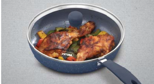
CERAMIC NONSTICK FRYING PAN